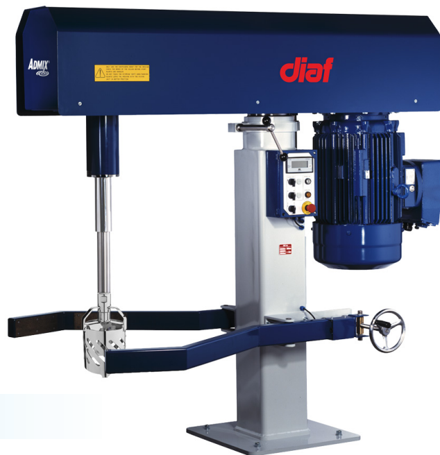
Diaf Dissolver 1200ZH

The Dissolver provides fast and excellent dispersion throughout the different process steps, it is extremely effective allowing short batch times and a higher total production capacity. The Dissolver models are available in both totally enclosed, with fan-cooled motor and explosion proof configurations.