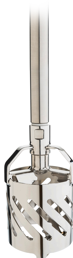
Rotosolver® high shear disperser