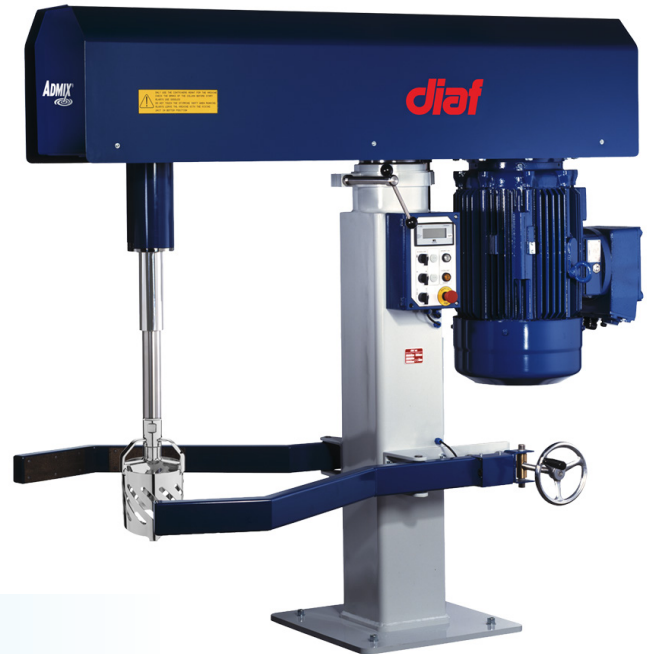
Diaf Dissolver 1200ZH

The Dissolver provides fast and excellent dispersion throughout the different process steps, it is extremely effective allowing short batch times and a higher total production capacity. The Dissolver models are available in both totally enclosed, with fan-cooled motor and explosion proof configurations.