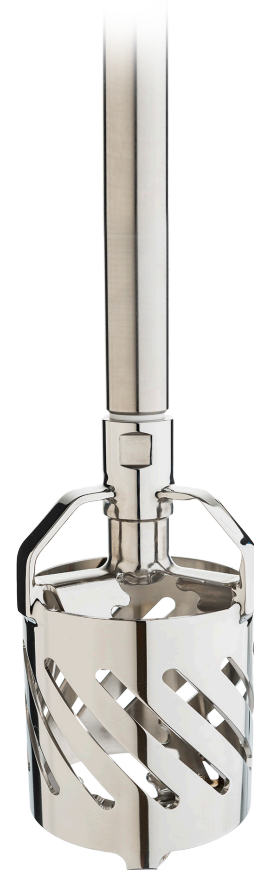
Rotosolver® high shear disperser